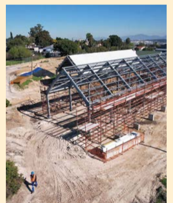
Centre taking shape: From mid-2025, the new multipurpose centre at Bracken nature reserve will be a hub of environmental education.