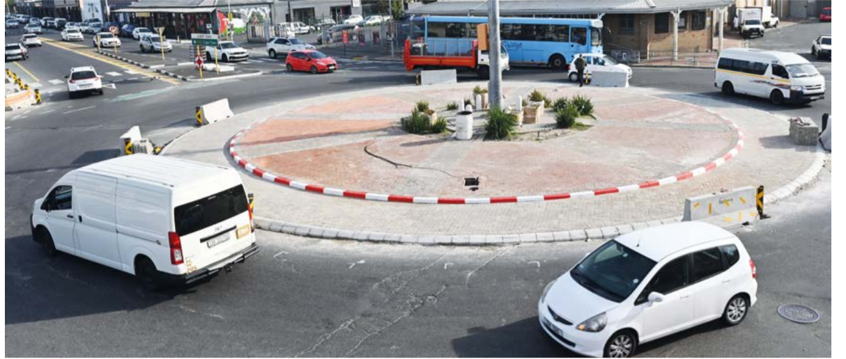
Repaired roundabout: Recent road rehabilitation in the Salt River and Woodstock areas included the repair of the Salt River circle.

Milling, filling and resurfacing of road