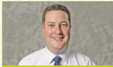
A MESSAGE FROM THE EXECUTIVE MAYOR

The City helps around 3 500 people annually with transitional shelter placement and referrals to a range of social services. Approaching the courts is always the last resort where offers of help are persistently refused, and every person