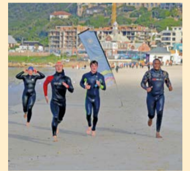
Fit to keep you safe: Lifeguards are key players in the City's drowning prevention programme and, therefore, are thoroughly assessed before appointed to keep pool and beach bathers safe. Top left: Candidates dive in for their swim test at the Long Street swimming pool. Right: Beach lifeguard hopefuls get a move on at Muizenberg.