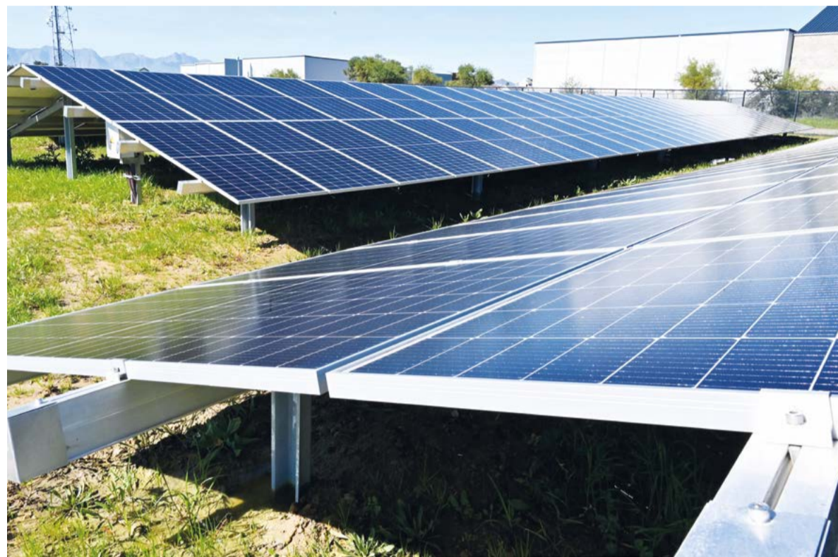
City unveils ground-mounted solar project: The City recently completed a 990 kWp renewable-energy project at the Kraaifontein wastewater treatment plant. The project was undertaken in support of the City's commitment to use sustainable energy sources to drive energy efficiency in internal operations and mitigate the effects of climate change. It also ties in with the City's drive to increase solar photovoltaic generation to bolster energy security in its own operations as well as in the residential and commercial sectors.