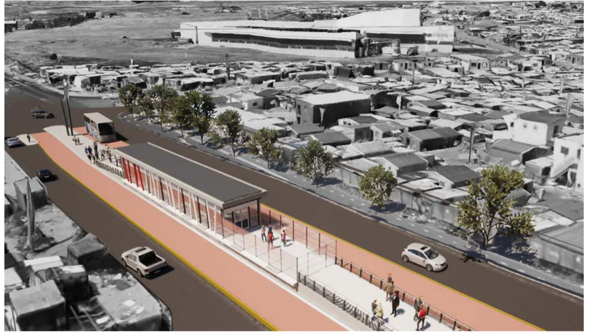
Back in bus-ness: Against the backdrop of a steady increase in demand for MyCiTi, the wheels are in motion to rebuild the vandalised stations in Dunoon, Joe Slovo and Phoenix. Pictured above is an artist's impression of what the restored station will look like.

There is good reason for the ongoing investment in MyCiTi infrastructure: The latest audited statistics confirm a steady increase in demand for the service along its current 44 routes across Cape Town. Destinations already served extend from the inner city, Century City, Woodstock